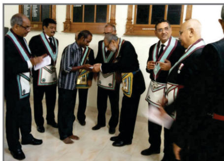
Contribution to Anandan for Children's Study