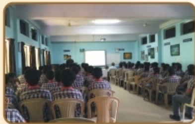
MENTORING FOR STUDENTS