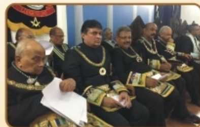
JOINT MEETING OF LODGES IN TRIVANDRUM